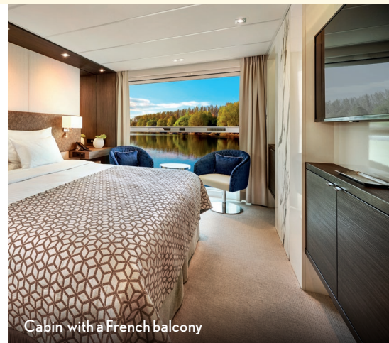
Cabin with a French balcony