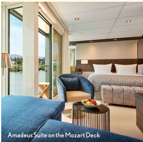
Amadeus Suite on the Mozart Deck