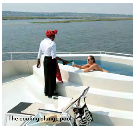
The cooling plunge pool