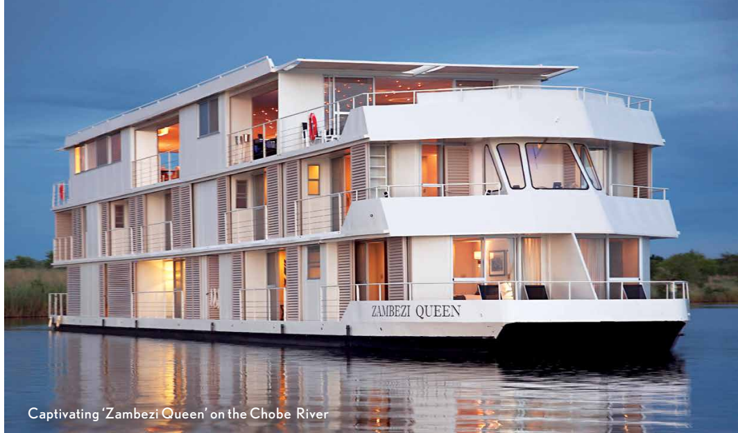
Captivating 'Zambezi Queen' on the Chobe River

No matter where you are on beautiful 'Zambezi Queen' — from your own private balcony to the breezy upper deck — find wide-open views of the surrounding African landscape and ample wildlife viewing opportunities.