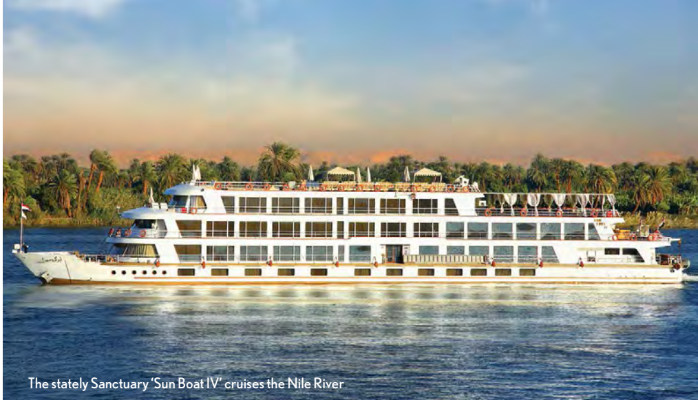
The stately Sanctuary 'Sun Boat IV' cruises the Nile River

Sanctuary 'Sun Boat IV' offers exquisite dining and peerless service, including excursions to the Nile's greatest monuments led by expert Egyptologists. This blend of style and substance inspired Condé Nast Traveler to name Sanctuary 'Sun Boat IV' the top small cruise ship in 2009.