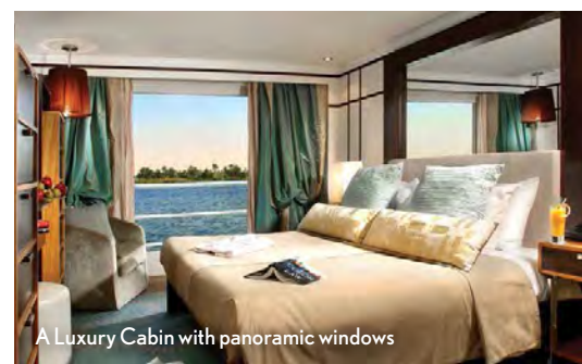
A Luxury Cabin with panoramic windows