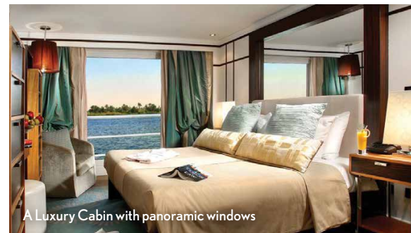
A Luxury Cabin with panoramic windows