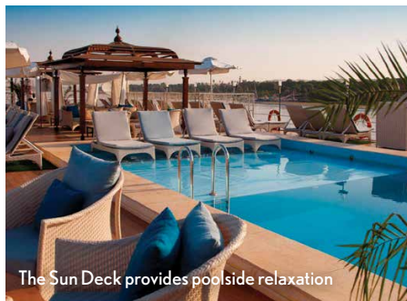
The Sun Deck provides poolside relaxation