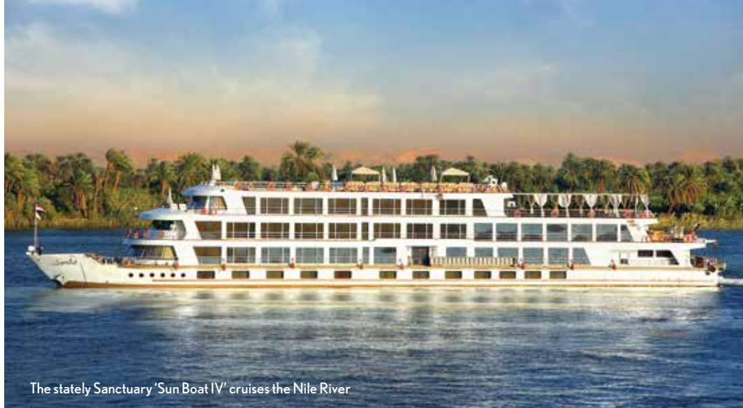
The stately Sanctuary 'Sun Boat IV' cruises the Nile River

Sanctuary 'Sun Boat IV' offers exquisite dining and peerless service, including excursions to the Nile's greatest monuments led by expert Egyptologists.