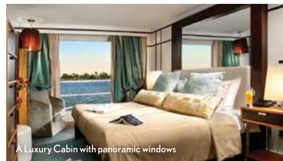
A Luxury Cabin with panoramic windows