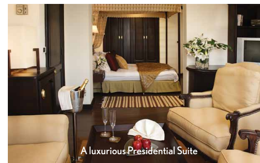
A luxurious Presidential Suite