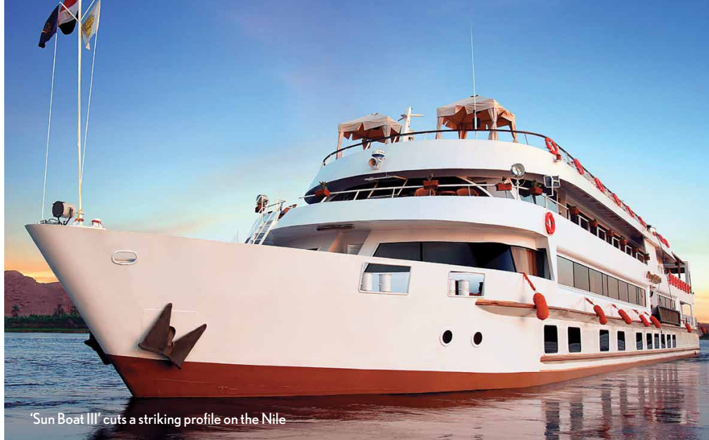
'Sun Boat III' cuts a striking profile on the Nile

Throughout your cruise, enjoy impeccable onboard service, top-notch amenities and lively onboard lectures. Combined with shore visits led by Egypt's finest guides, it is hardly surprising that Architectural Digest dubbed 'Sun Boat III' the "Jewel of the Nile."