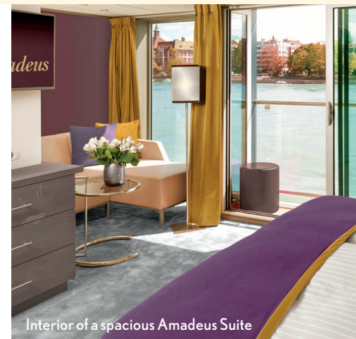
Interior of a spacious Amadeus Suite