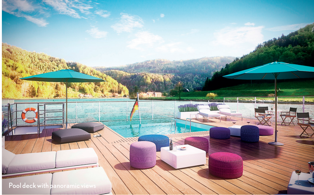
Pool deck with panoramic views

As with the entire privately owned Amadeus fleet, the ship was designed and built in Europe for quality control.