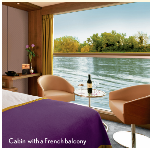
Cabin with a French balcony