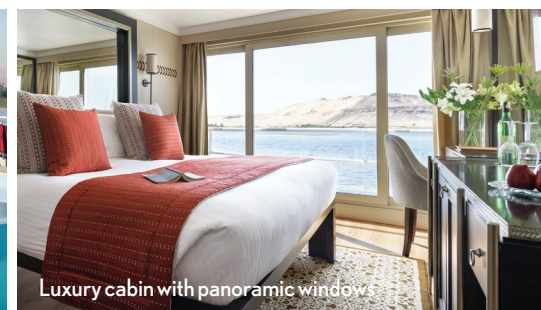
Luxury cabin with panoramic windows