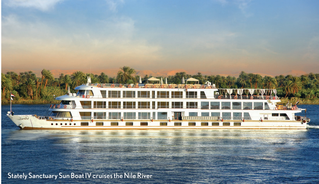
Stately Sanctuary Sun Boat IV cruises the Nile River

Sanctuary Sun Boat IV offers exquisite dining and peerless service, including excursions to the Nile's greatest monuments led by expert Egyptologists.