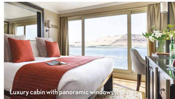
Luxury cabin with panoramic windows