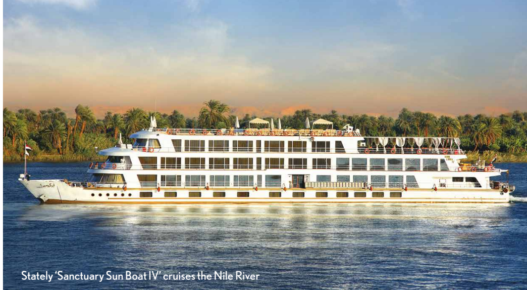
Stately 'Sanctuary Sun Boat IV' cruises the Nile River

'Sanctuary Sun Boat IV' offers exquisite dining and peerless service, including excursions to the Nile's greatest monuments led by expert Egyptologists.