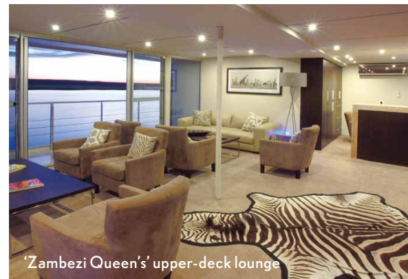
'Zambezi Queen's' upper-deck lounge