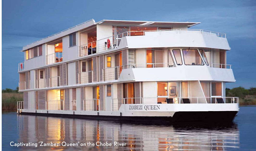
Captivating 'Zambezi Queen' on the Chobe River

No matter where you are on beautiful 'Zambezi Queen' — from your own private balcony to the breezy upper deck — find wide-open views of the surrounding African landscape and ample wildlife-viewing opportunities.