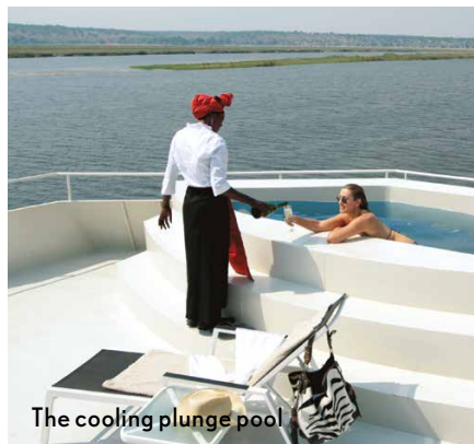
The cooling plunge pool