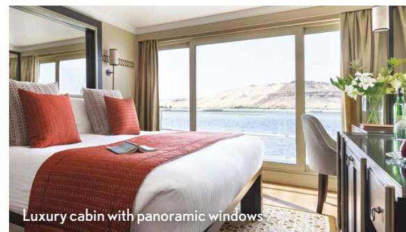
Luxury cabin with panoramic windows