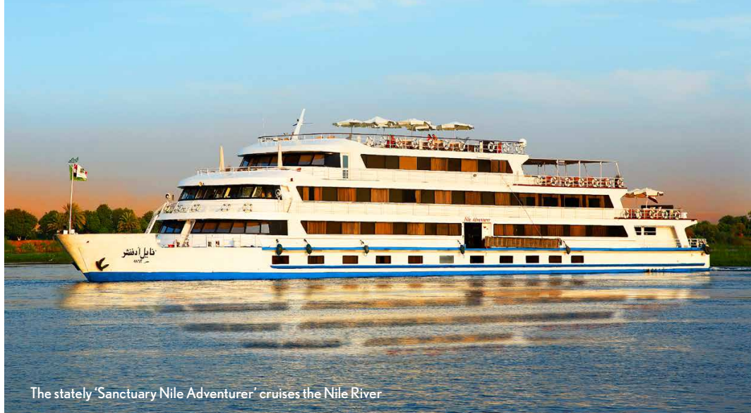
The stately 'Sanctuary Nile Adventurer' cruises the Nile River

'Sanctuary Nile Adventurer' offers exquisite dining and peerless service, including excursions to the Nile's greatest monuments led by expert Egyptologists.