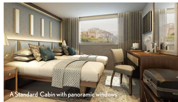
A Standard Cabin with panoramic windows