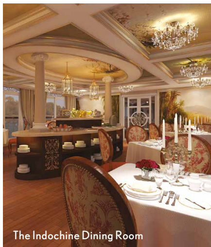
The Indochine Dining Room

NOTE: The following suites feature fixed king beds and cannot be converted into twin beds: Angkor Suites (201 & 202), Tonle Suites (203 & 204)