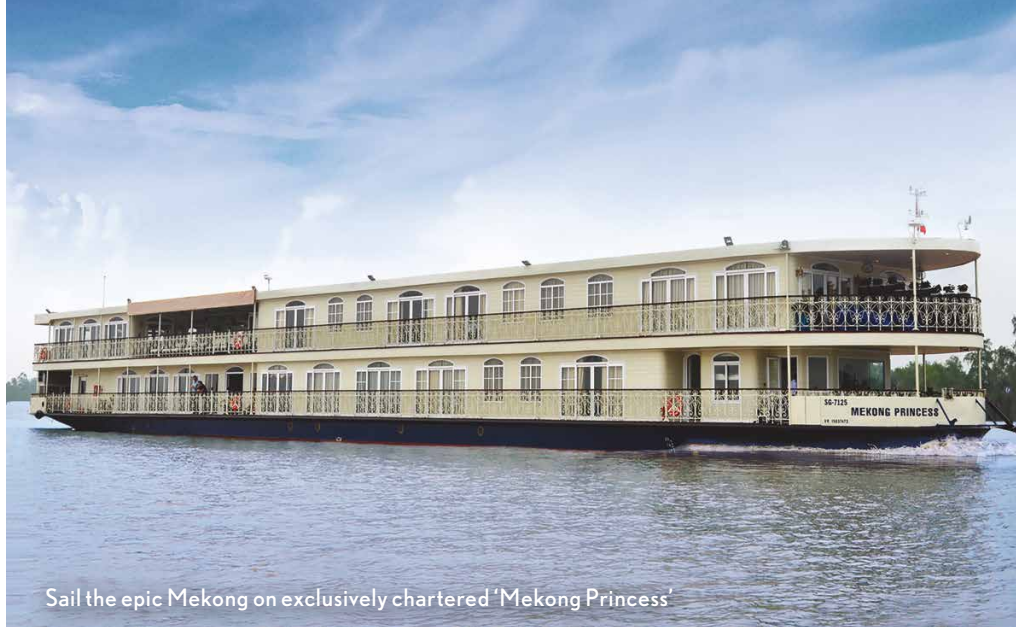
Sail the epic Mekong on exclusively chartered 'Mekong Princess'

While plying the waters, pause to watch life unfold from the Observation Deck, recounting activities in the Lounge and staying connected in the Library. Keep in shape in the fully equipped fitness center.