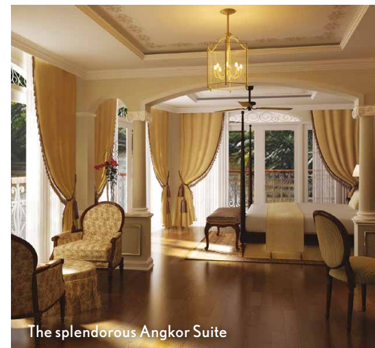
The splendorous Angkor Suite