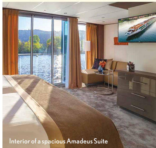
Interior of a spacious Amadeus Suite