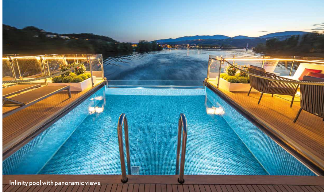
Infinity pool with panoramic views

As with the entire privately owned Amadeus fleet, the ship was designed and built in Europe for quality control.