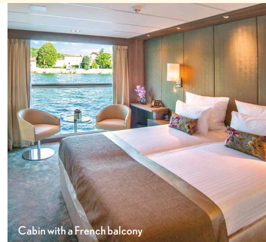
Cabin with a French balcony