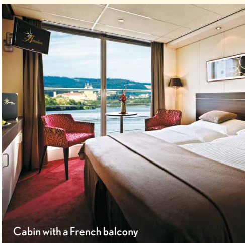
Cabin with a French balcony