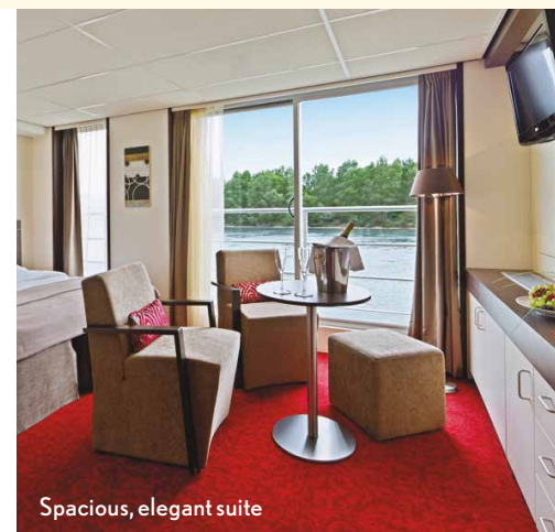
Spacious, elegant suite