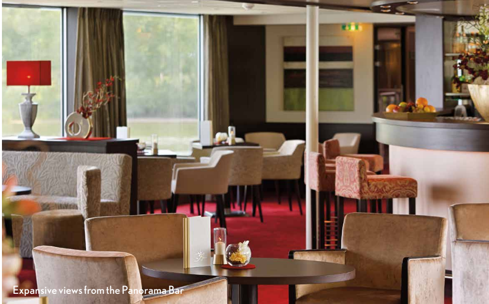
Expansive views from the Panorama Bar

The vessel was designed and built in European shipyards for quality control.