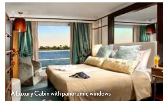
A Luxury Cabin with panoramic windows