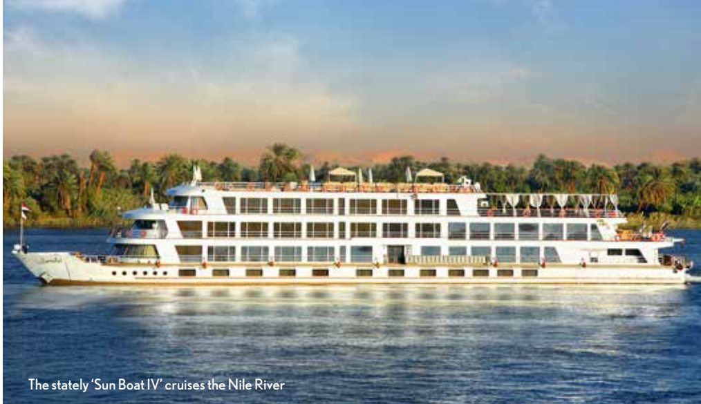
The stately 'Sun Boat IV' cruises the Nile River

'Sun Boat IV' offers exquisite dining and peerless service, including excursions to the Nile's greatest monuments led by expert Egyptologists. This blend of style and substance inspired Condé Nast Traveler to name 'Sun Boat IV' the top small cruise ship in 2009.