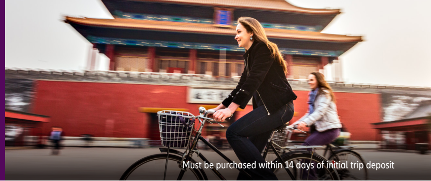
Must be purchased within 14 days of initial trip deposit

Whether you're planning a solo adventure or a grand, multi-generational getaway, the whole point is to relax and enjoy your trip. Allianz Travel Insurance gives you the confidence to focus on the experience, knowing you are protected against many common travel mishaps and emergencies by a reputable company with a global network and award-winning customer service.