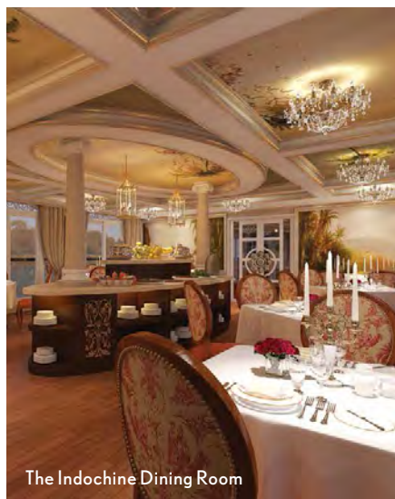
The Indochine Dining Room