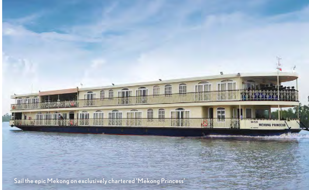
Sail the epic Mekong on exclusively chartered 'Mekong Princess'

While plying the waters, pause to watch life unfold from the Observation Deck, recounting activities in the Lounge and staying connected in the Library. Keep in shape in the fully equipped fitness center.