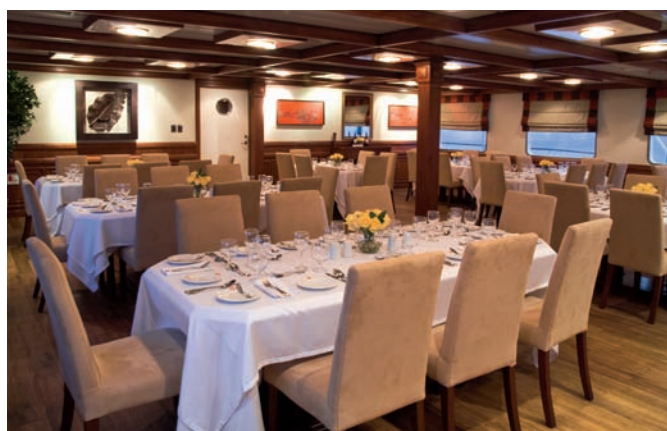
The dining room aboard 'Eclipse'