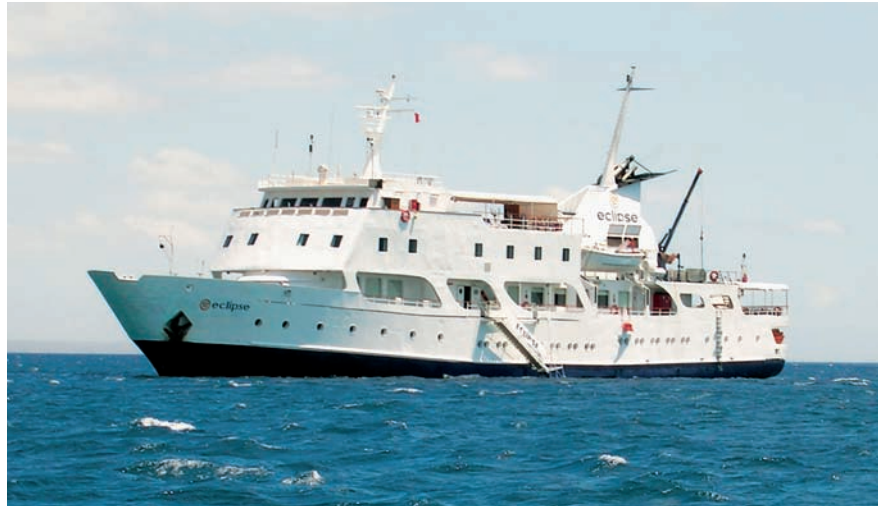
The stately 'Eclipse' sailing the Pacific