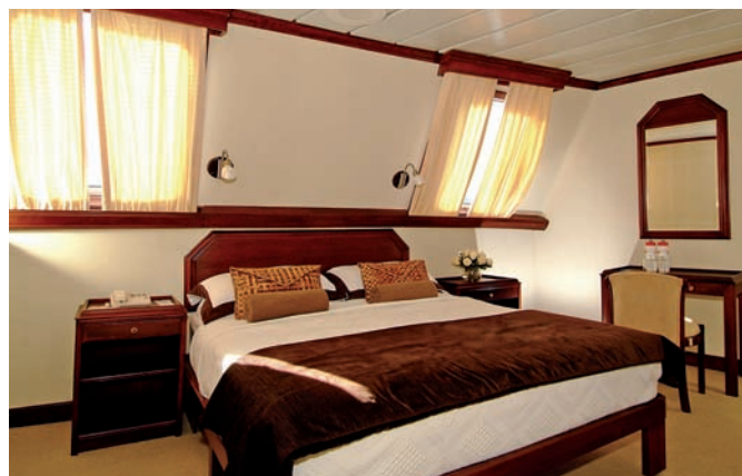
A spacious Deluxe Stateroom on board 'Eclipse'

With the "non-cruise" atmosphere aboard 'Eclipse' and its warm and relaxed sense of camaraderie, you don't need to pack anything dressier than "smart casual" wear. The dining room, lined with picture windows, can seat everyone at once and extends outdoors on the Boat Deck for al fresco dining. The best seats in the house for wildlife viewing and guided star-gazing presentations are found topside on the Sun Deck, whereas the lounge has comfortable seating, perfect for an informal talk with the naturalist guides who bring this complex region to life.