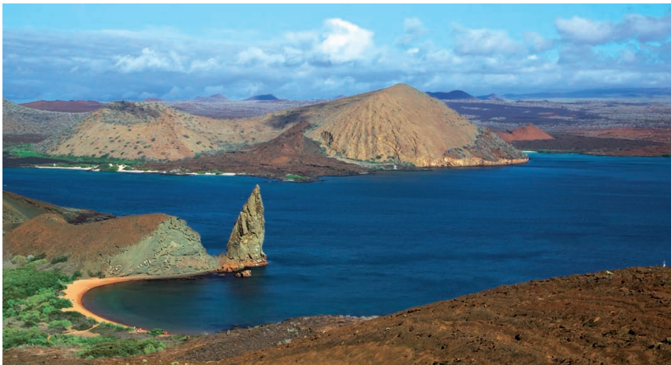
The pristine Galápagos