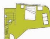
CABIN 18 Area: 210 sq. ft. approx.