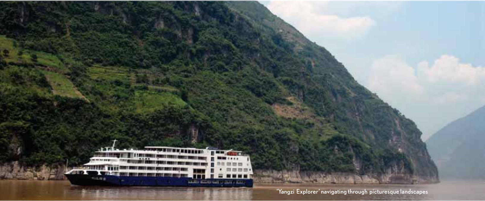
'Yangzi Explorer' navigating through picturesque landscapes

A Yangzi River cruise with A&K is a voyage of discovery and tranquility through the Three Gorges region, a magical place with thousands of years of history as well as timeless natural beauty. With shore excursions led by expert guides along with inspiring on-board activities, a 'Yangzi Explorer' cruise provides an adventure for every type of traveller.