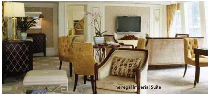
The regal Imperial Suite

'Yangzi Explorer's' on-board China specialists coordinate a range of educational programs and shore excursions, unraveling the historical, cultural and environmental factors that have made the Yangzi so integral to 3,000 years of Chinese history.