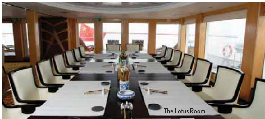
The Lotus Room