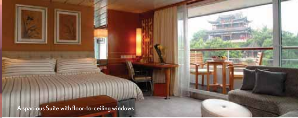
A spacious Suite with floor-to-ceiling windows