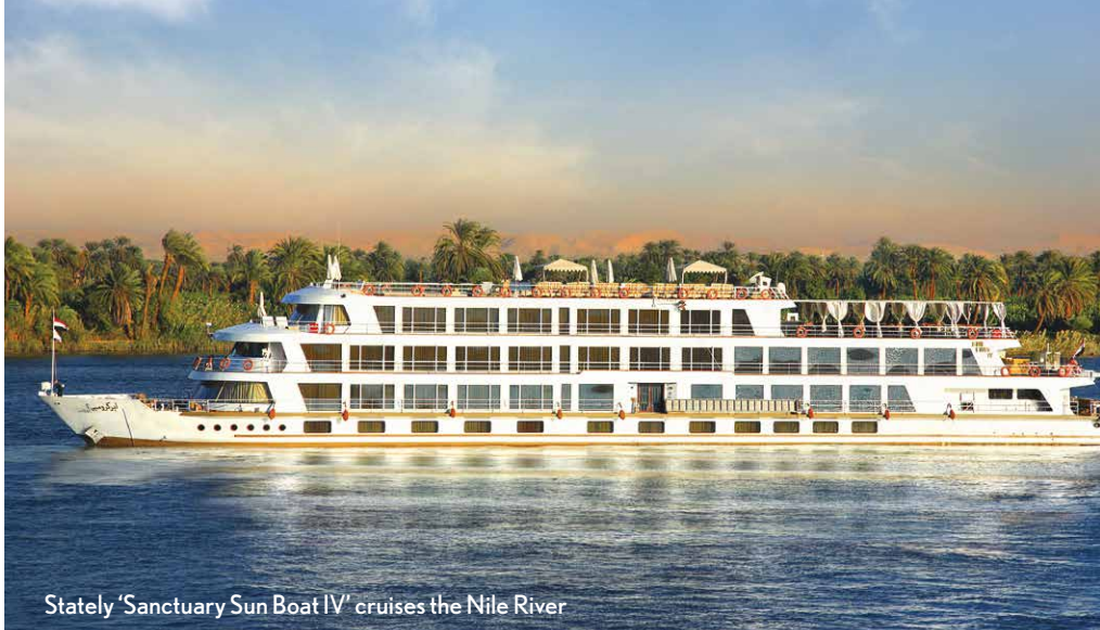
Stately 'Sanctuary Sun Boat IV' cruises the Nile River

'Sanctuary Sun Boat IV' offers exquisite dining and peerless service, including excursions to the Nile's greatest monuments led by expert Egyptologists.