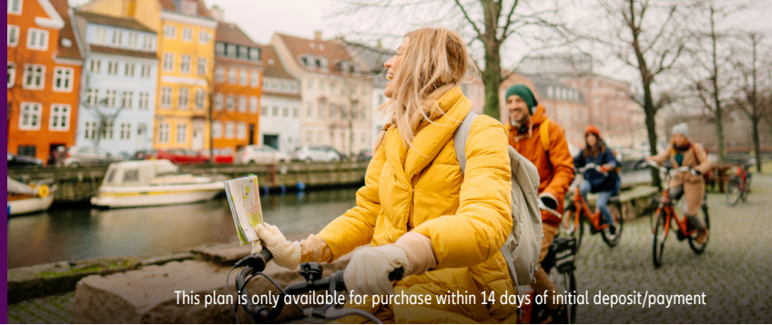
This plan is only available for purchase within 14 days of initial deposit/payment

Whether you're planning a solo adventure or a grand, multi-generational getaway, the whole point is to relax and enjoy your trip. Allianz Travel Insurance gives you the confidence to focus on the experience, knowing you are protected against many common travel mishaps and emergencies by a reputable company with a global network and award-winning customer service.