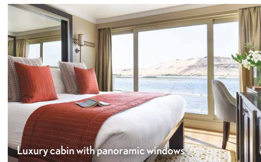
Luxury cabin with panoramic windows