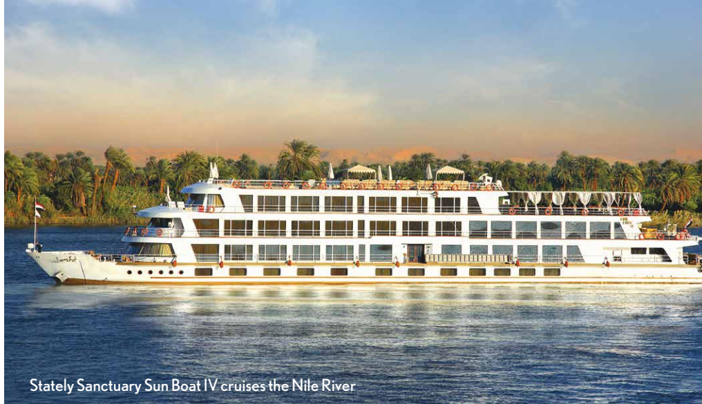
Stately Sanctuary Sun Boat IV cruises the Nile River

Sanctuary Sun Boat IV offers exquisite dining and peerless service, including excursions to the Nile's greatest monuments led by expert Egyptologists.